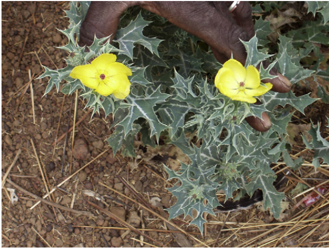
Figure 1. Argemone mexicana L. (Papaveraceae).

lead to the very widespread use of ACTs, and a greatly increased risk of resistance.